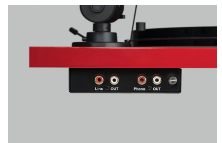
Switchable line or phono output and built-in Bluetooth transmitter