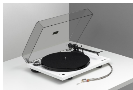
Dust cover, felt mat and high quality connection cable Connect-it E included