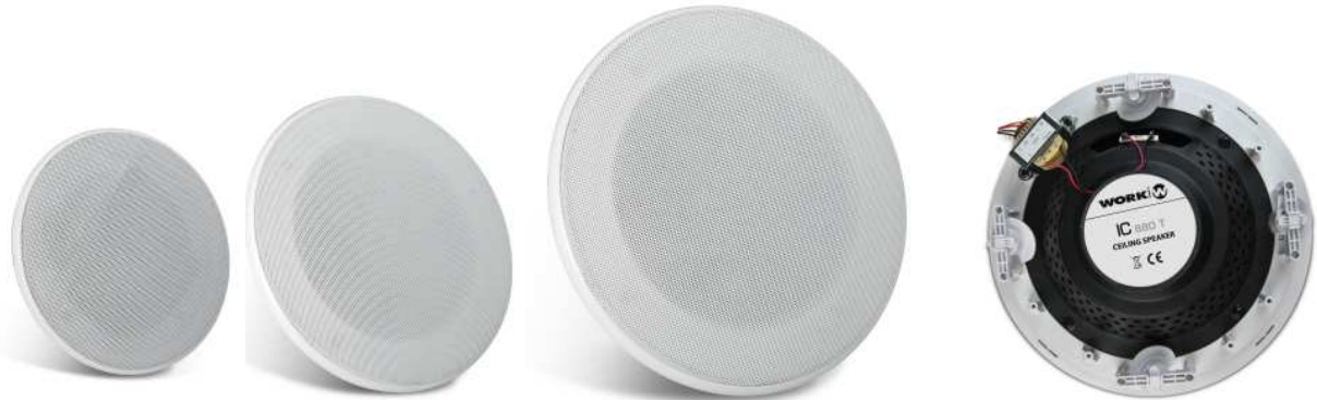
IC 550 T