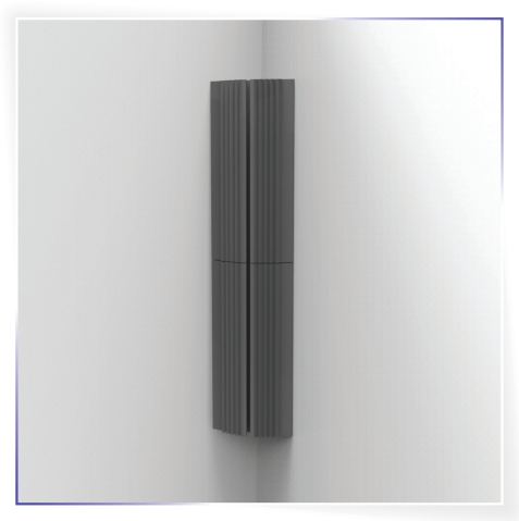
POLYFON-KiON quarter at the corner as a Bass Trap.

• Home Theatres, bar, restaurants, malls, Recording & Post Production Studios, Rehearsal Rooms, Conference Rooms, multipurpose hall, etc.