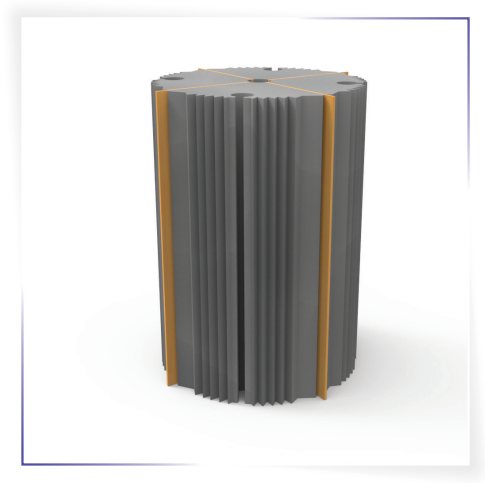
POLYFON-KiON Round Trap with wooden fins.