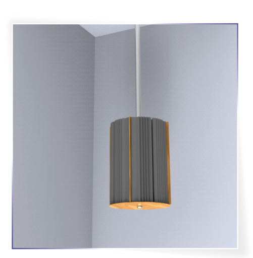
POLYFON-KiON hanging from ceiling, with wooden fins.