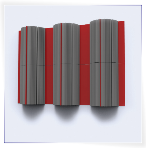
POLYFON-KION Semi cylinder on the wall with vary fins.